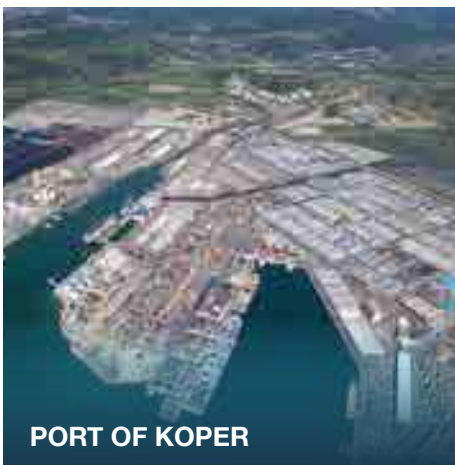
PORT OF KOPER