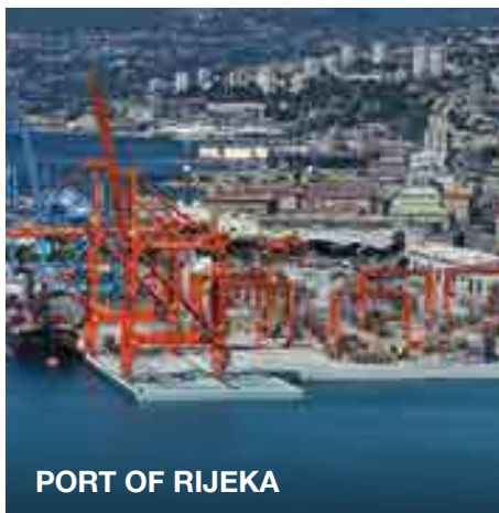
PORT OF RIJEKA