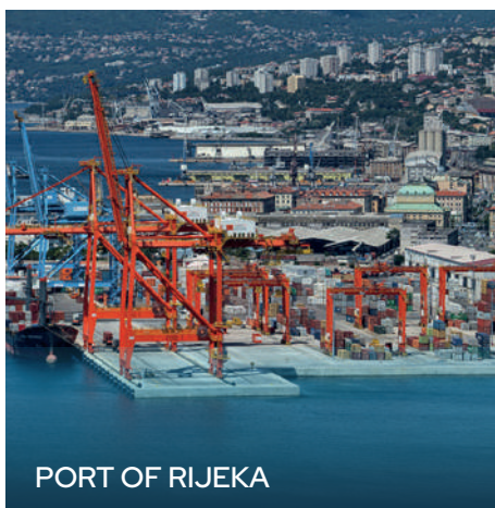
PORT OF RIJEKA