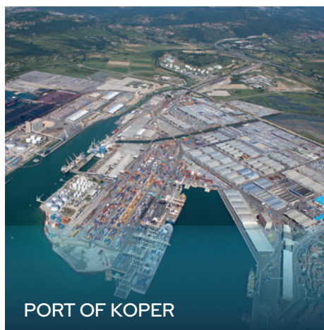
PORT OF KOPER