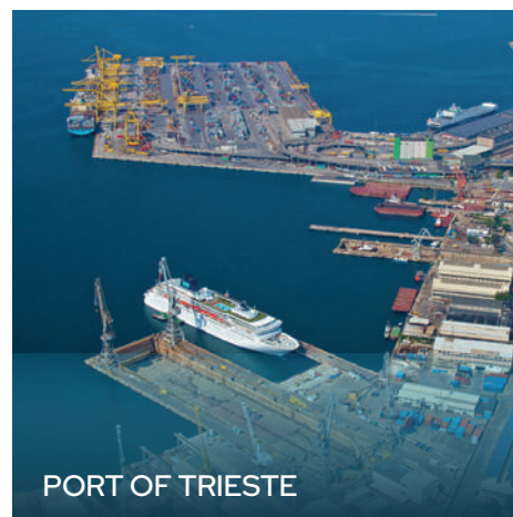
PORT OF TRIESTE